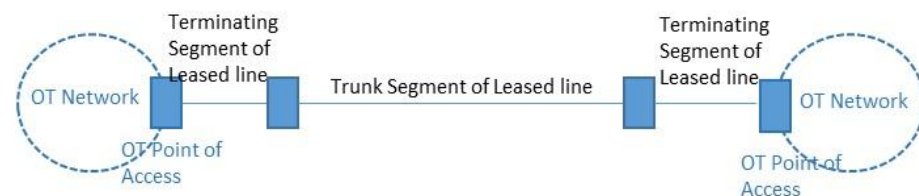
Figure 3-3 Generic representation of Transmission Service Type C